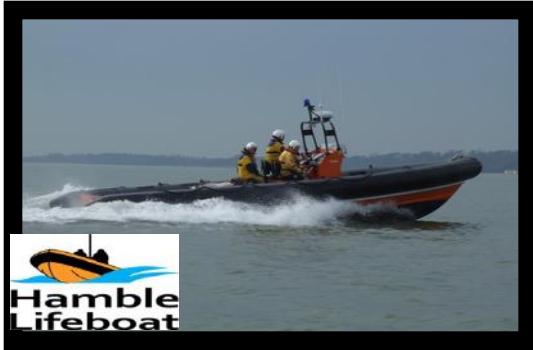
Hamble Lifeboat Independent Service (Volunteers) Pac 32 Twin WJ