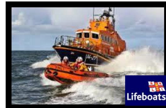
RNLI Life Boats Inshore & All Weather