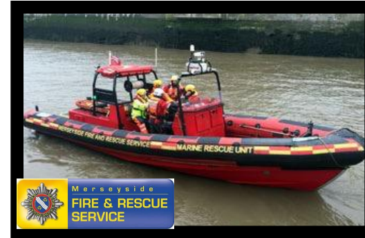
Marine Fire 1 Merseyside Fire & Rescue Service MST Jet RIB