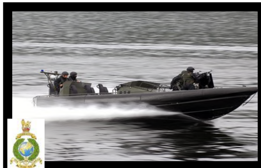
Military Raiding & Landing Craft RM Offshore Raiding Craft (ORC)