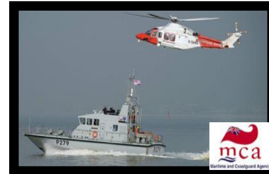
Patrol & SAR Operations P2000 Archer Class Coast Guard AW 139/189