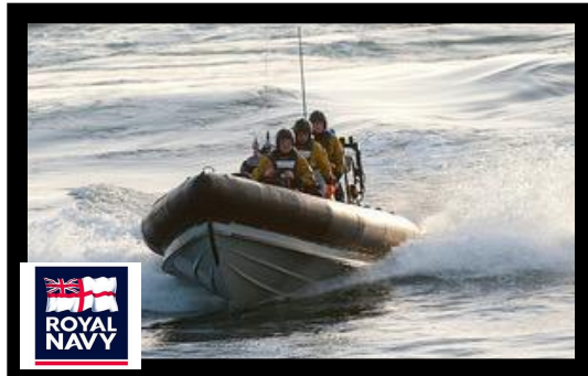
Royal Navy Royal Naval Reserve & University Royal Naval Unit Pac 22/24